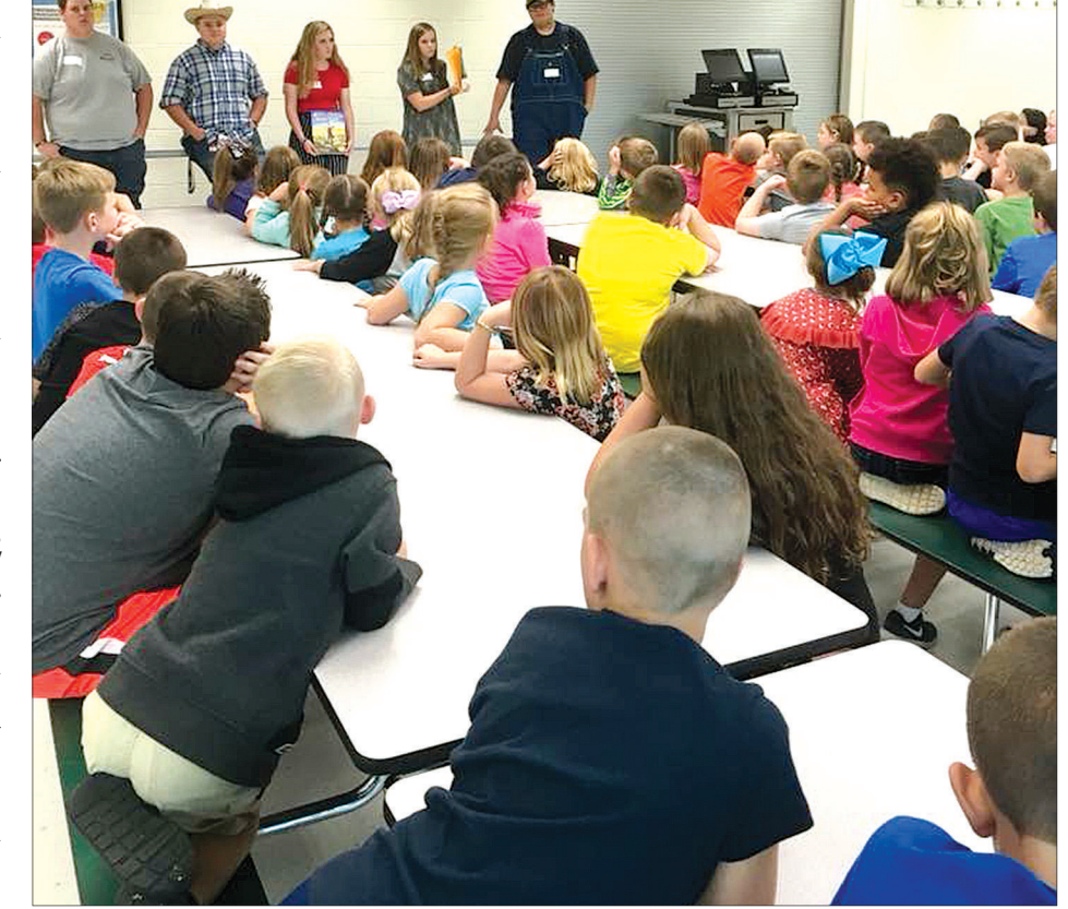
Members read an agriculture book to students at Green County Primary School in September.