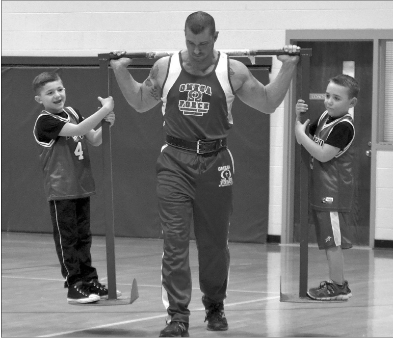
Two Upward athletes are carried around the gym floor by a member of the Omega Force Strength Team Saturday night at GCMS.