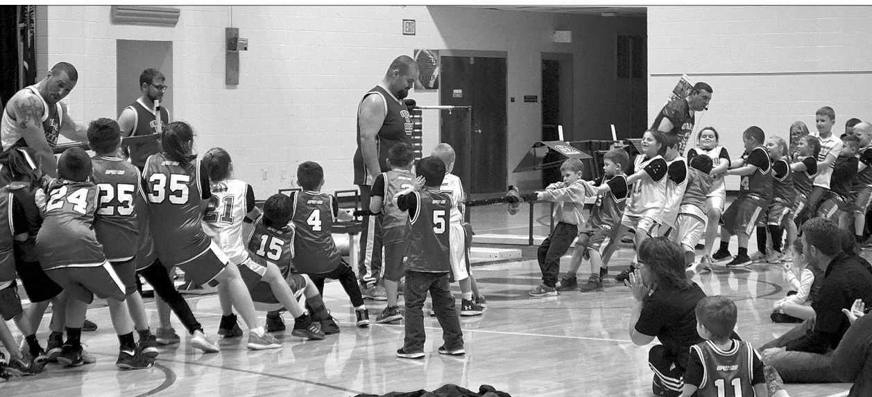
Upward athletes participated in a tug of war during the Awards Night program on Saturday night. The program was held at Green County Middle School.