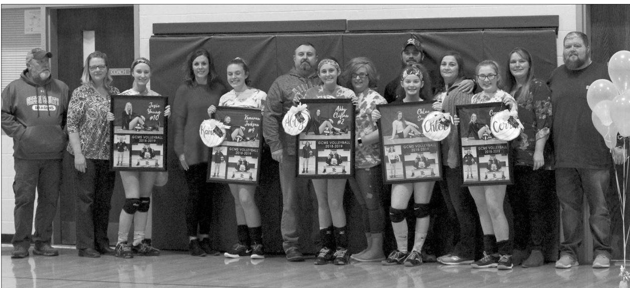
Eighth grade volleyball players and their parents smile while displaying the action shot posters and gifts they received from the team during eighth grade night Feb. 19.