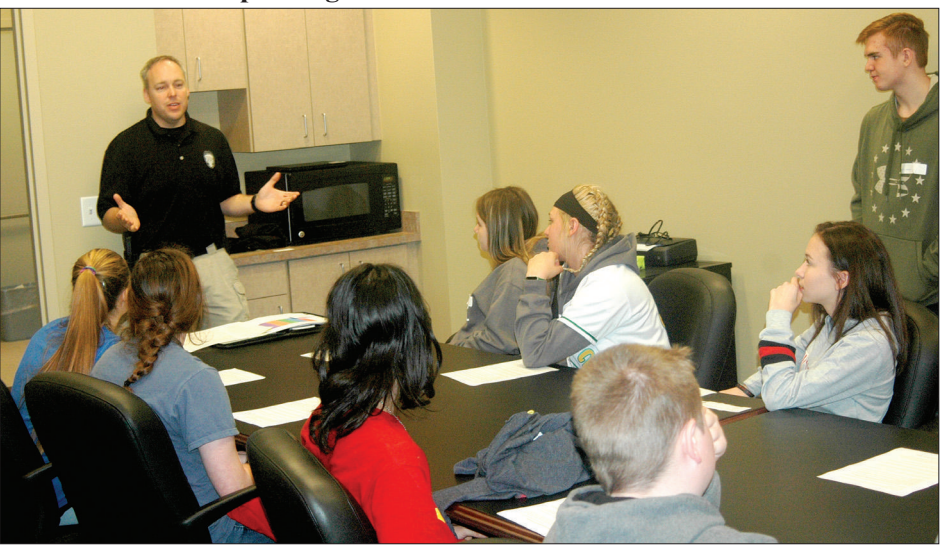
Control, explains the role of ABC in the prevention of access to alcohol and tobacco by underage individuals.