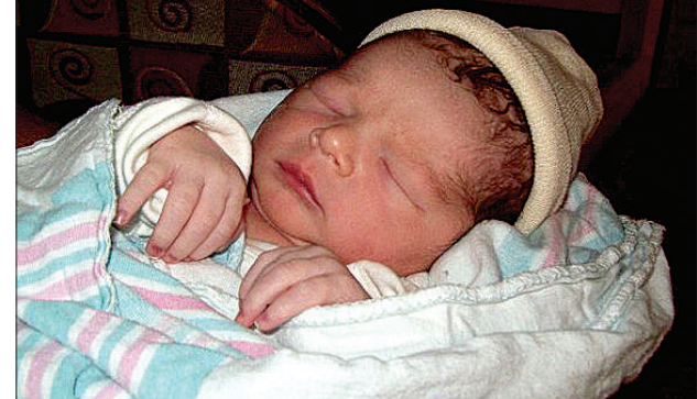
My 7-pound, 7-ounce life changer.