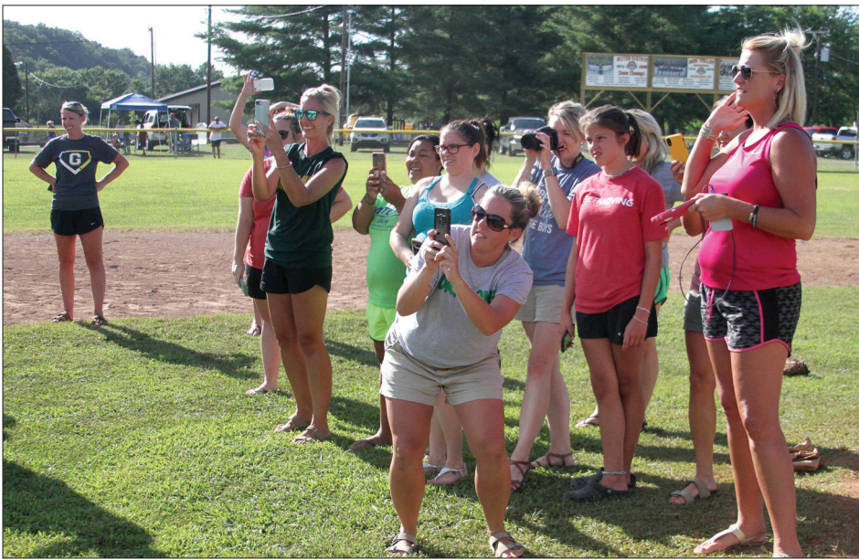
Proud parents, family, friends and fans flooded the field to take photos of the 10U State Champions as they were presented their awards. The team took a trip on a fire truck to celebrate their Sunday winning.