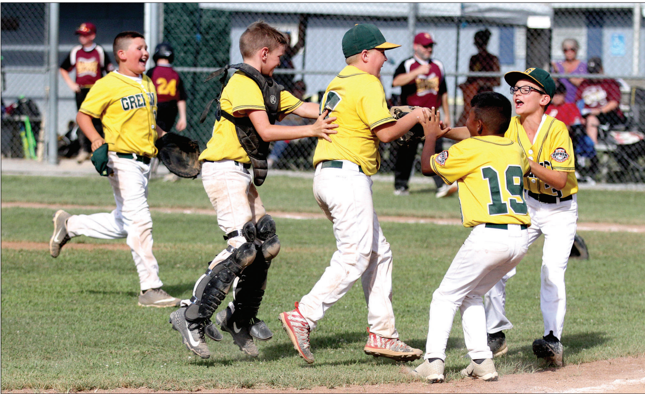
10U players and coaches take the field in celebration after they sealed a State title.