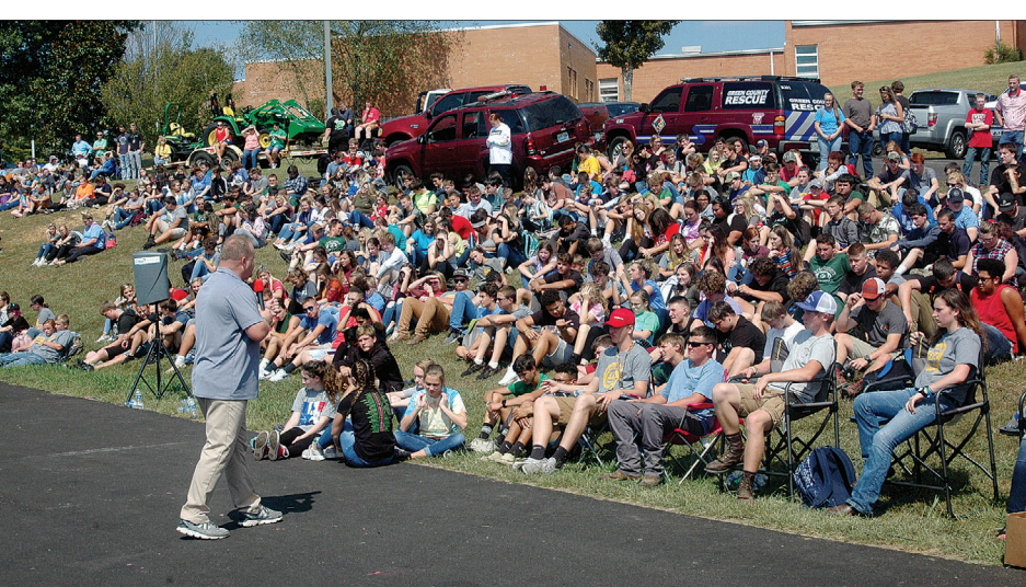
Greensburg Mayor John Shuffett addressed the GCHS student body during Ag Safety Day.