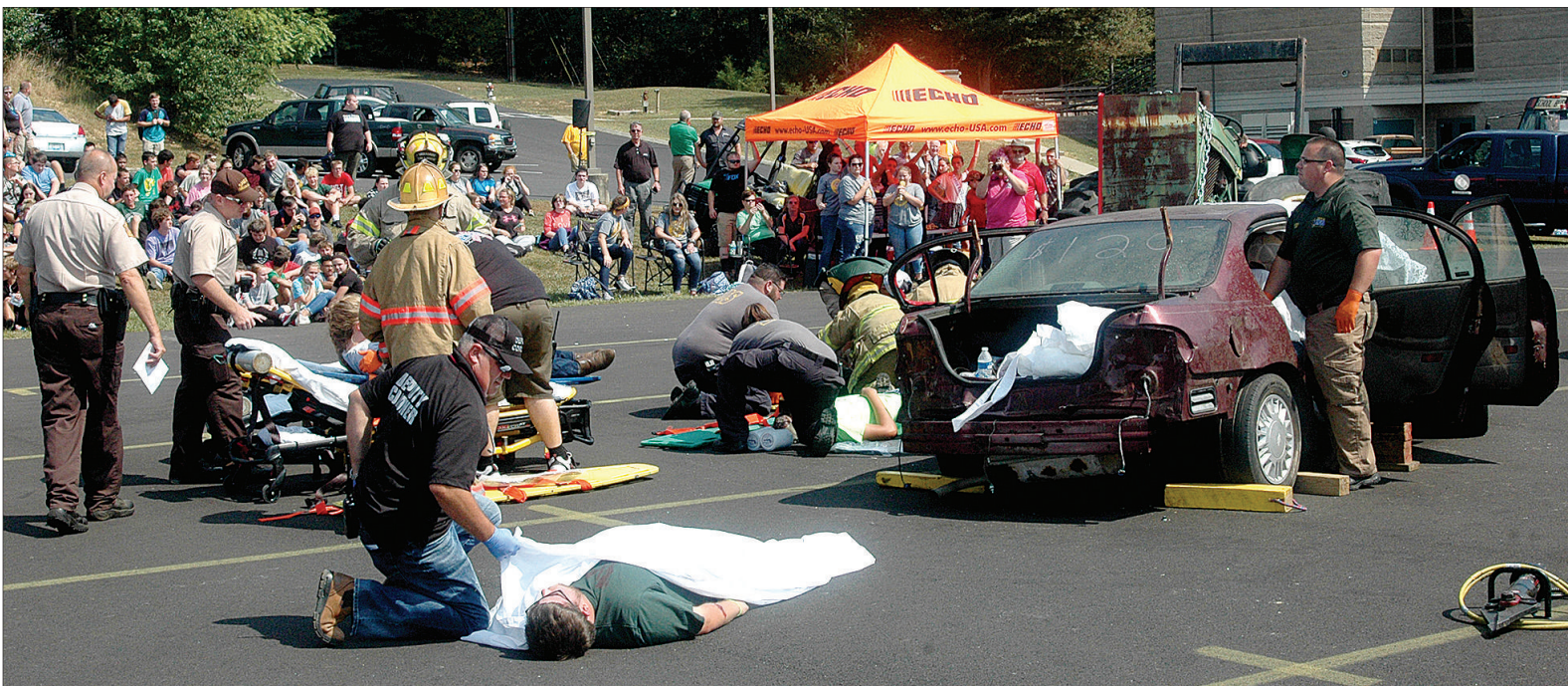
A mock tractor-car accident exercise with fatalities and injuries was presented before the GCHS student body Thursday during Ag Safety Day. Taking part in the mock exercise hosted by the Green Co. FFA were local emergency services and law enforcement, Cowherd and Parrott and Foster-Toler-Curry Funeral Homes, and the Air Evac Lifeteam.