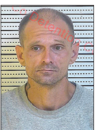
TC Detention photo