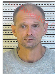
TC Detention photo