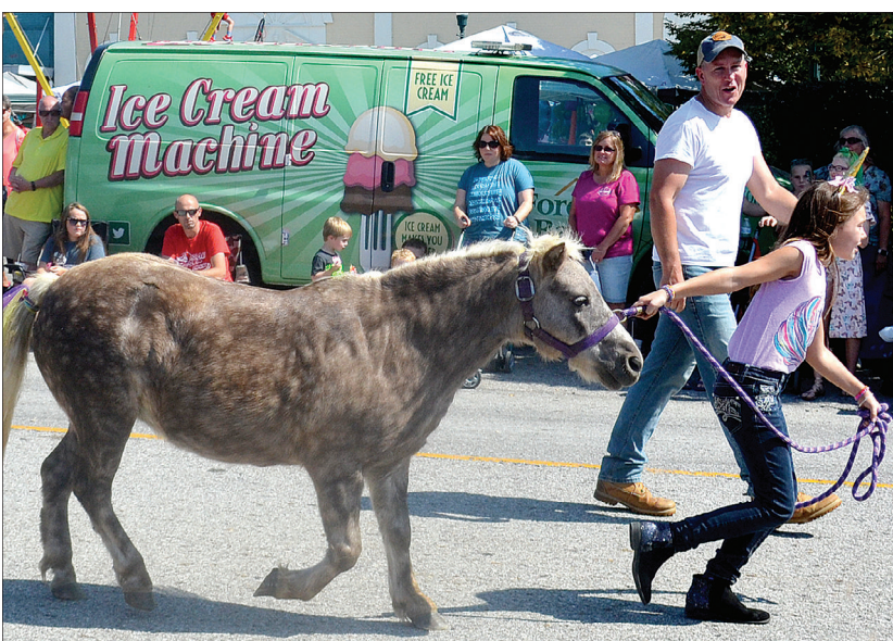
Just a girl and her pony parade down Main Street.