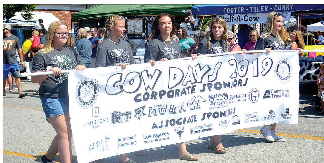
Junior Rotary Club members lead the way in the Green County Cow Days 2019 Parade Saturday afternoon.