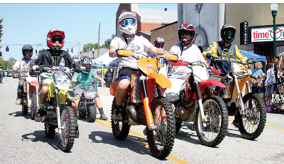
The parade was full of local faces, dirt bikes, atvs and more.