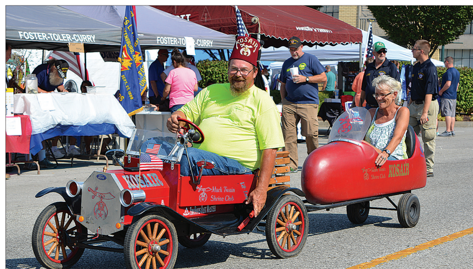
The Shriners are always a Cow Days Parade favorite.