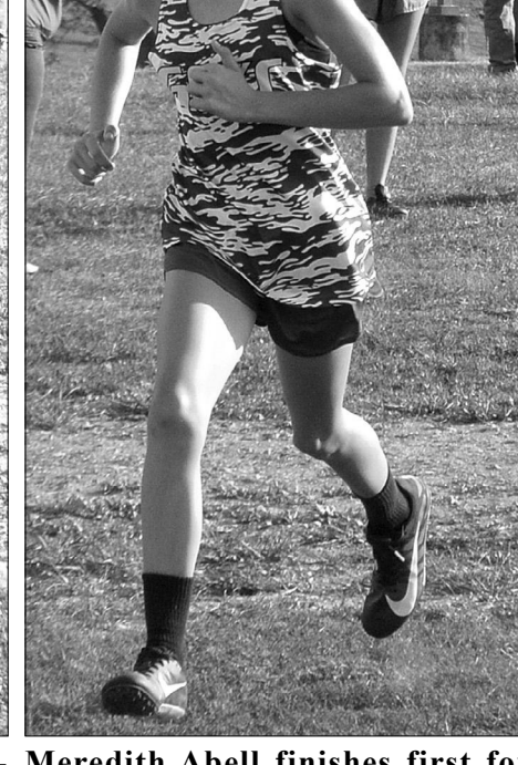
in the women's 2700 meter race for middle school girls.