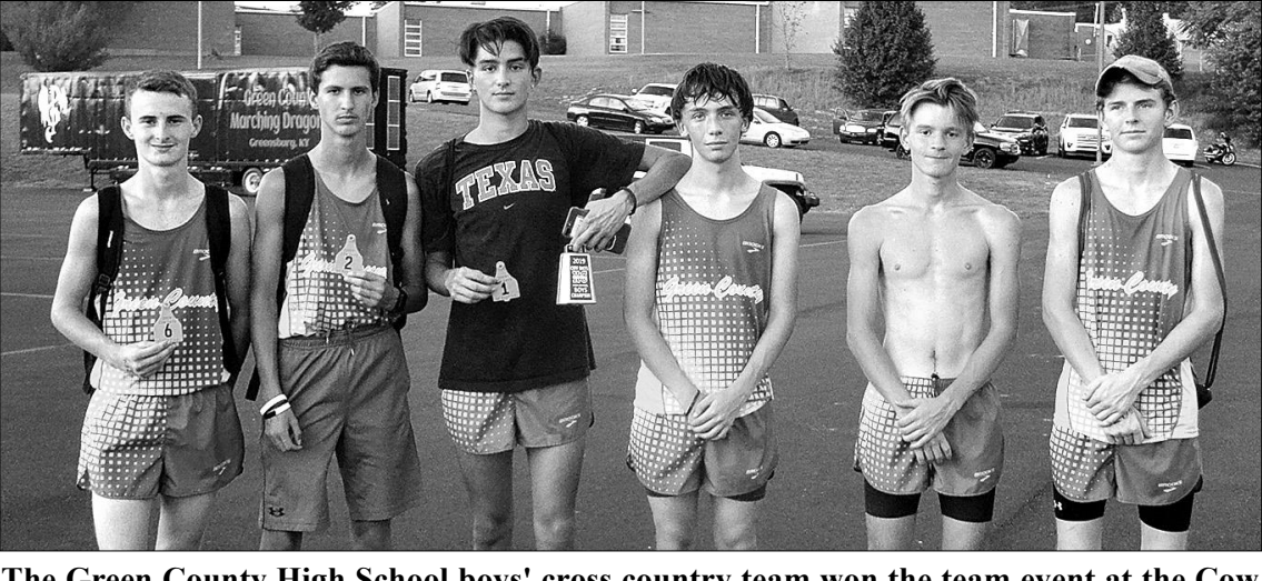
The Green County High School boys' cross country team won the team event at the Cow Days Festival last week.