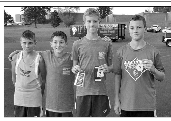
The Green County Middle School men's team took first place honors in the Cow Days Race. Some members are missing from the photo but they turned in a perfect score of 15.