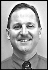
Tim Dixon Memorial Counselor