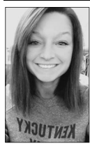
Crystal Cecil Record-Herald Staff

I don't plan to write any stories or check any emails.