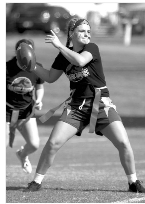
Powder Puff Football action is a favorite during homecoming week.