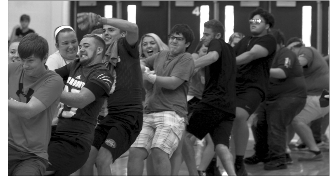
Heave ho! the seniors pull with all their might, beating the sophomores and advancing to the finals. The juniors defeated the seniors in the tug-o-war finals.