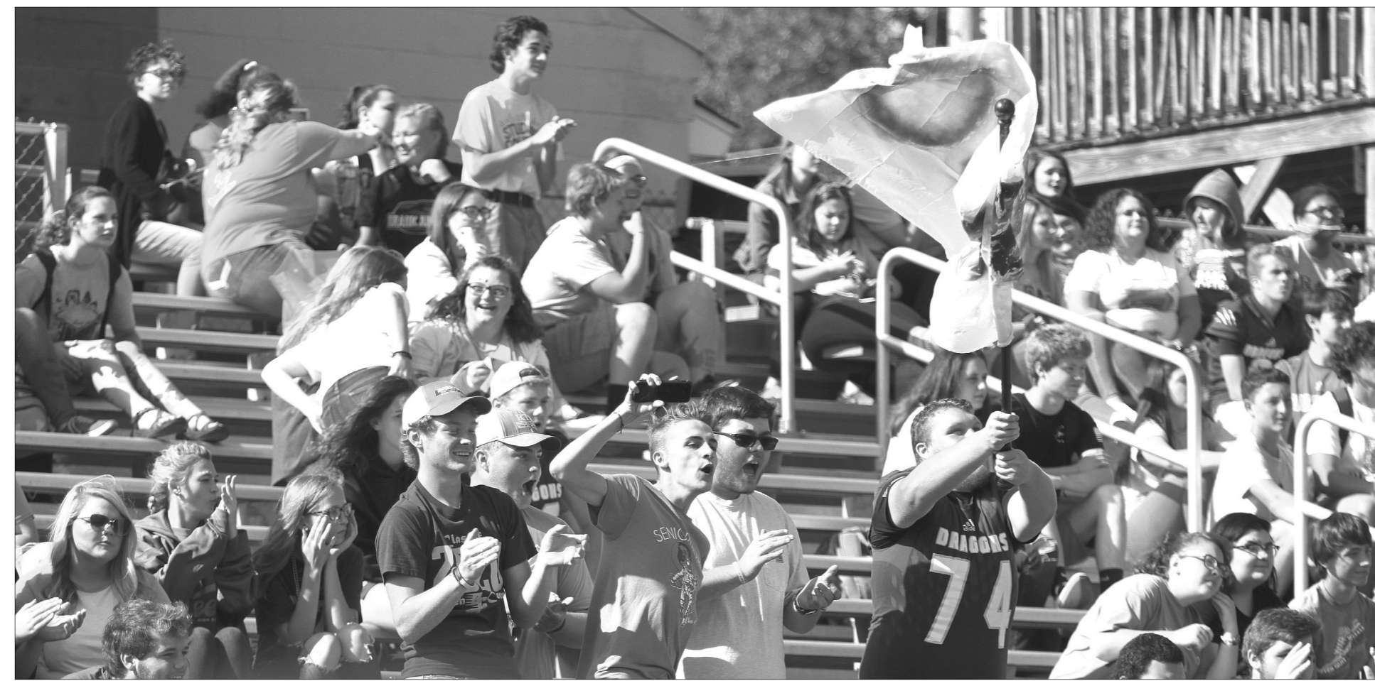
Homecoming week is always a favorite at Green County High School. This year the week was held Sept. 30-Oct. 4.