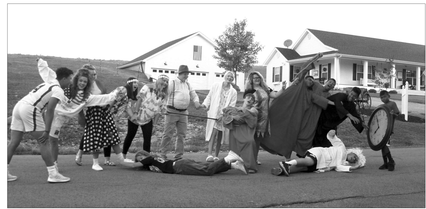
Each day of homecoming week high school students were allowed to wear designated themes. The sophomores went all out of Time Travel Thursday complete with a time travel device.