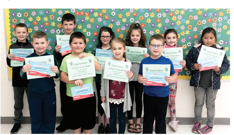
These Green County Primary School second grade students were selected as September Students of the Month.