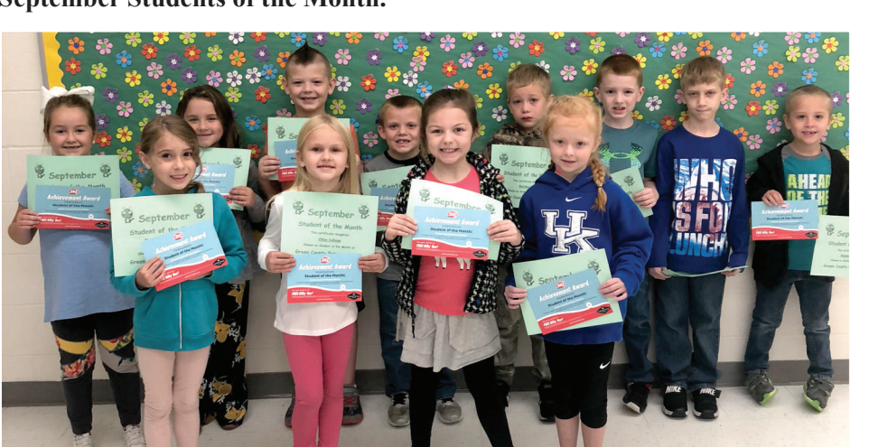
These Green County Primary School first grade students were selected as September Students of the Month.