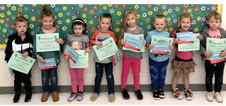
These Green Primary School preschool students were selected as September Students of the Month.