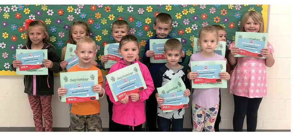
These Green County Primary School kindergarten students were selected as otember Students of the N lanth