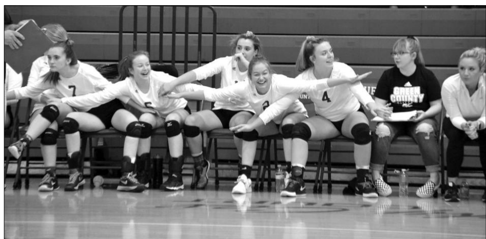
Players on the bench are heavily invested in the game in the district championship.

Green County last won the 5th Region Tournament in 2014 but since then, have only advanced past the first round one time and that was in 2015 when they lost to Central Hardin in the semi-finals.