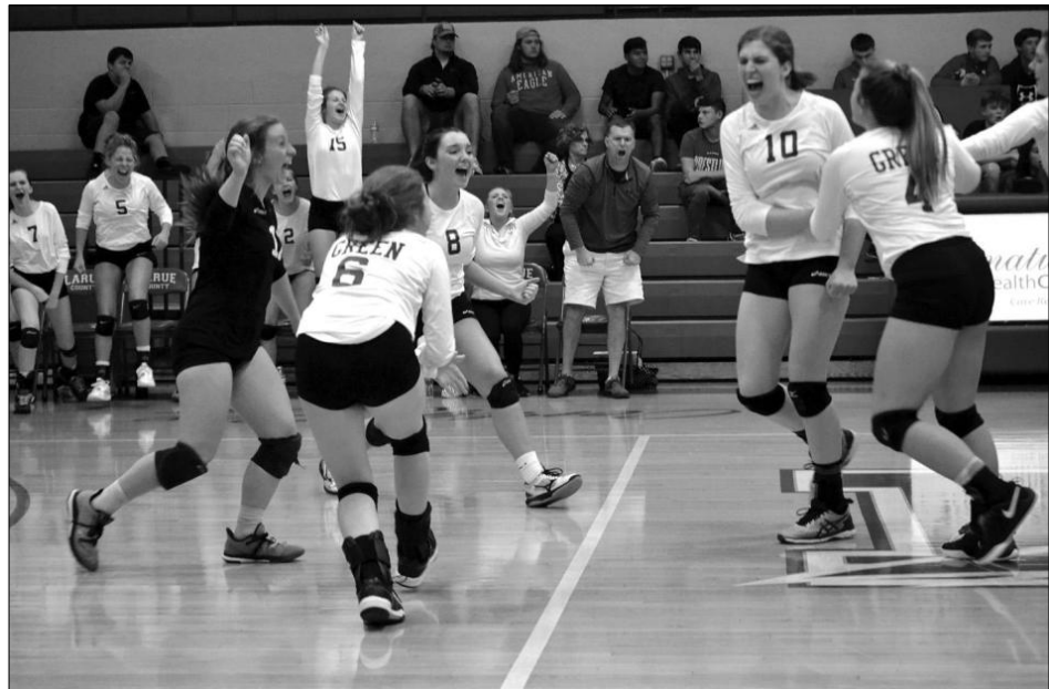
The Dragons' volleyball team celebrate a big point against LaRue County in the championship of the 18th District Tournament at Hodgenville last week.