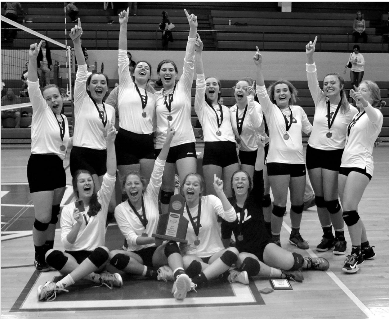
The Dragons fought hard to win the district championship, 19-25, 25-19, 25-21, 24-26, 17-15. This win was the fourth win for Green County over the Hawks this year.