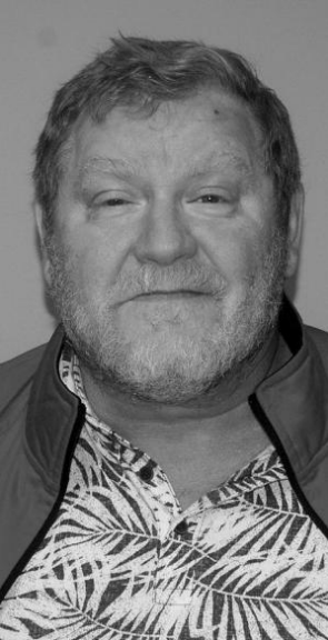
"I probably will pass out goodies to the trick-or-treaters." — Mike Rowe