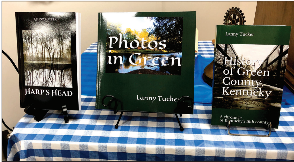
Lanny Tucker's books are for sale at Longhunters Coffee and Tea Co. and Glovers Station.