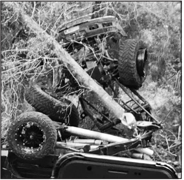
Pictures from a passerby shows that the 2006 Chevrolet truck broke apart during the crash.

FHP says Kinsey was pronounced dead at the scene by Marion County Fire Rescue.