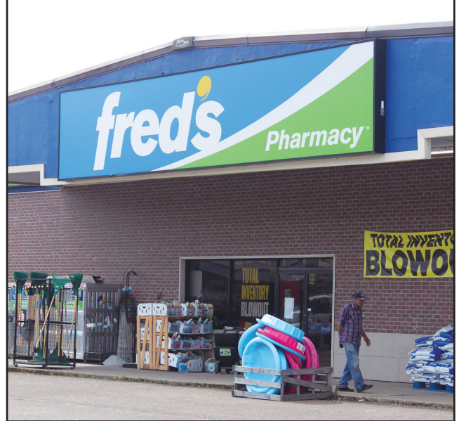
The Lexington location of Fred's (pictured above) was added to the list of store closures on June 21 by Memphis based Fred's Inc.

On May 3, 2018, Postal (Continued on page 3)