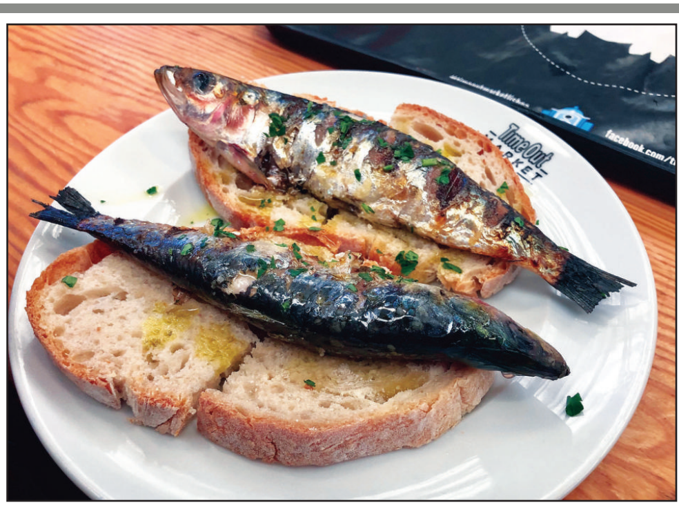
Sardines on toast was among the Spanish delicacies sampled in Avila, Spain.

Day six began with a tour of the charming city of Salamanca, which is sometimes referred to as the land of Spanish scholars. The group's first stop was at the public library called "The House of Shells" because of the beautiful shells that adorn the outside of the ancient building. Its construction began in 1493. The vacationers then visited Salamanca University, founded in 1218, and were impressed to see the halls, courtyards and classrooms in Spain's most prestigious university. The ancient library upstairs had a sign that threatened the students with excommunication if they were caught stealing a book. Next, the travelers toured Salamanca's Old Cathedral and New Cathedral which are joined together. The Old Cathedral, whose construction was begun in the 12th century in Romanesque