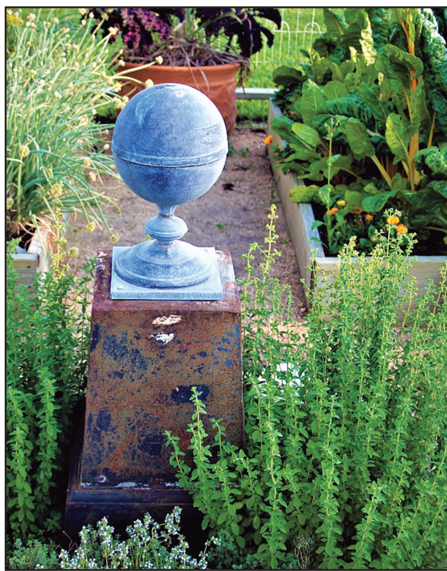
Small formal raised bed herb garden.