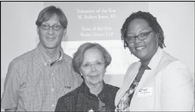
Special to The Clinton Courier