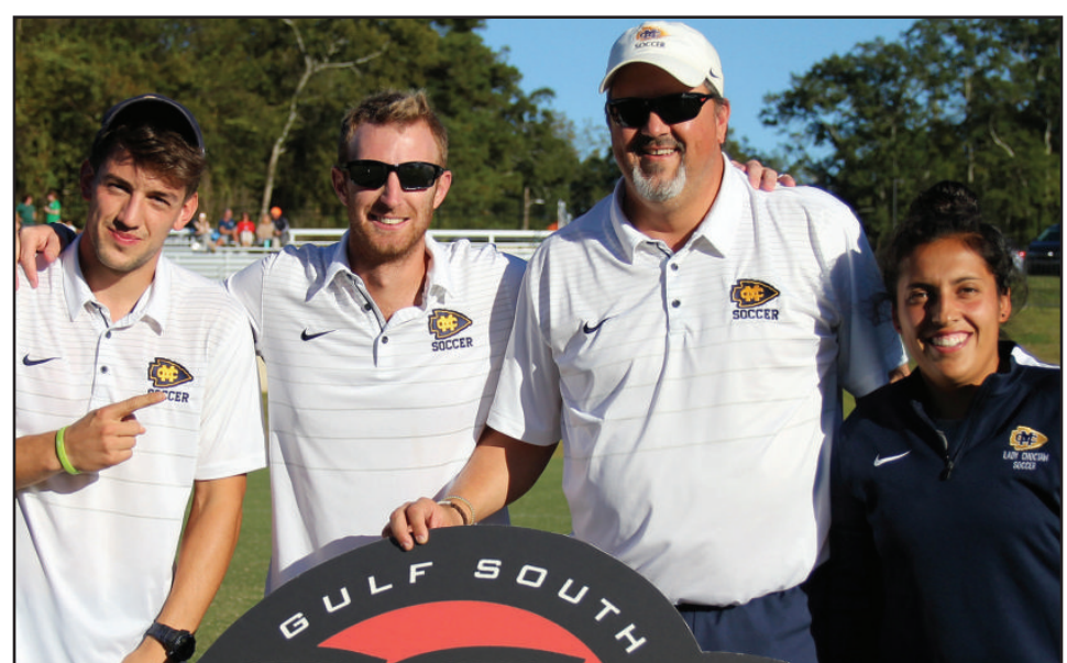
Special to The Clinton Courier