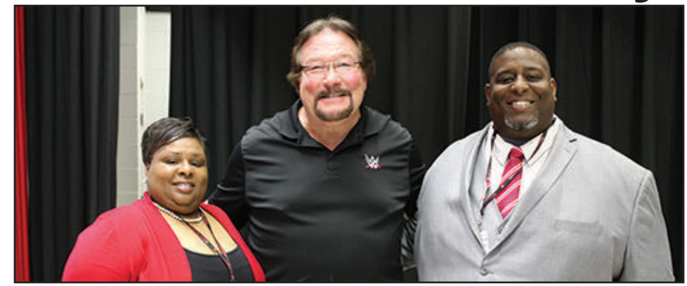
Special to The Clinton Courier