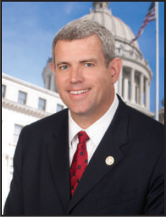
Special to The Clinton Courier

On January 8, 2019, the 134th Mississippi State Legislature began the fourth and final session in its four-year term.