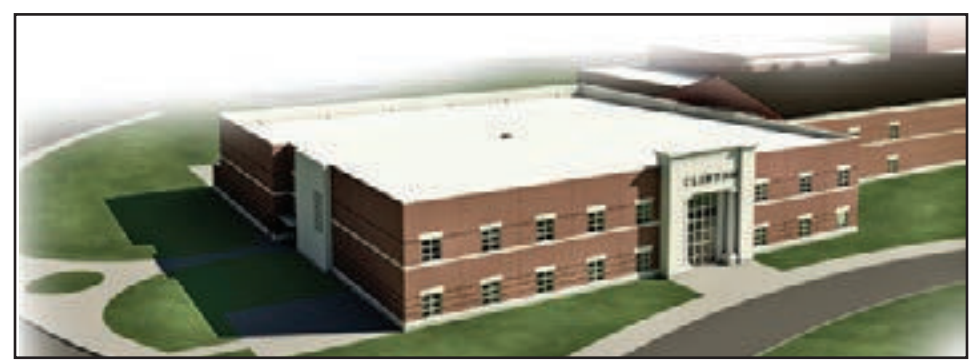
Special to The Clinton Courier

"The work at Clinton High School is the biggest component of the bond