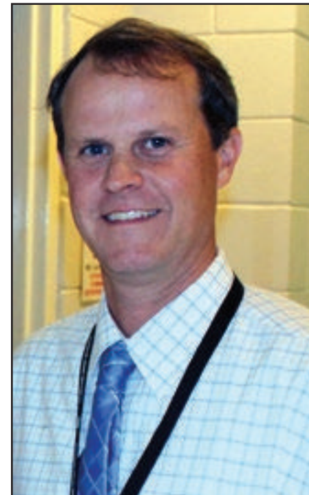
Special to The Clinton Courier

The NIAAA is a national professional organization consisting of all fifty state athletic administrator associations and more than 12,000 individual members. It is dedicated to promoting the professional growth of high school athletic administrators and preserving the educational