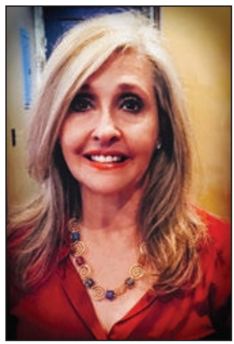
Special to The Clinton Courie

ning of readings from a collection of Henley's plays was featured in Fondren Theatre Workshop's Playwright