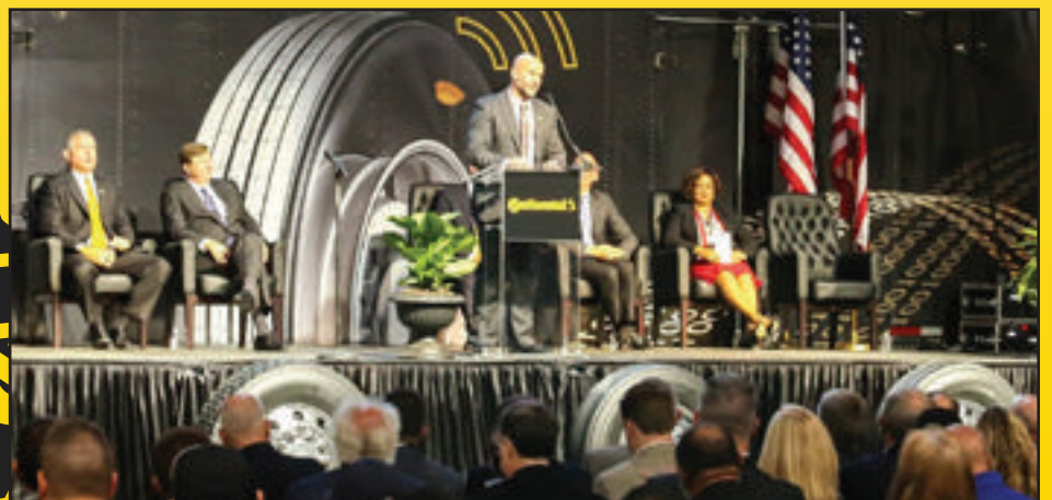
Special to The Clinton Courier

Reception Reception 10:00 a.m. - 12:30 p.m.