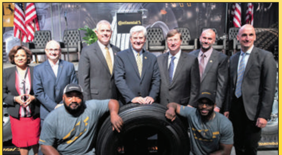
Special to The Clinton Courier