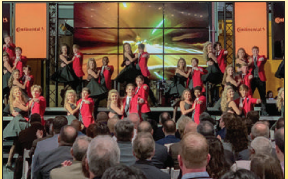
Special to The Clinton Courier