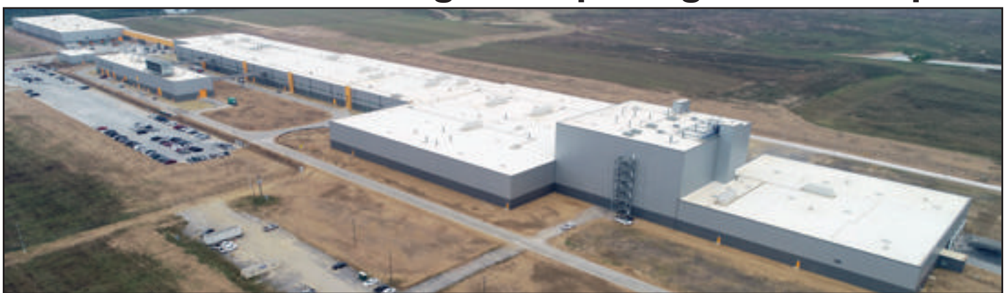
Special to The Clinton Courier

Continental Tire recently celebrated the grand opening of their Clinton plant, which is expected to employ 2,500 at full capacity.