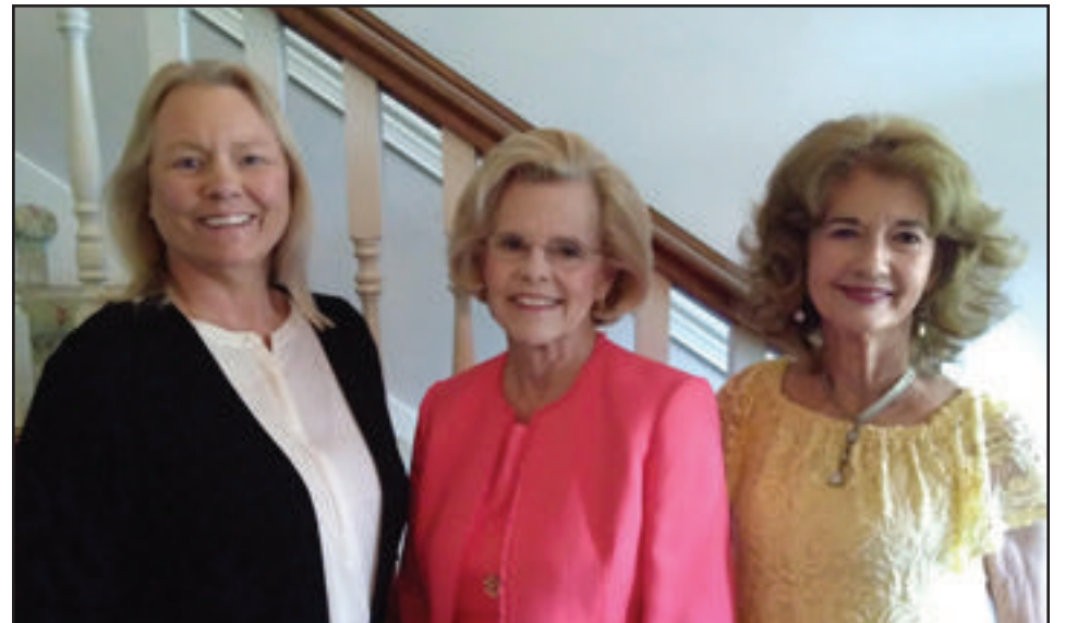
Special to The Clinton Courier