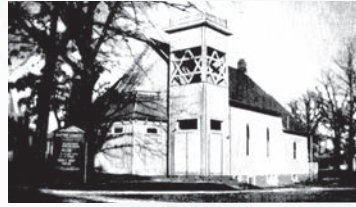
First building dedicated on July 16, 1899. In 1947 the church celebrated its 50th anniversary the membership totaled 319.