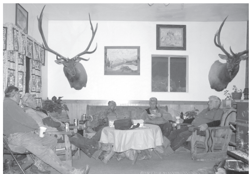
This is the bull pen where hunts are relived and plans made for the next day. In the 17 seasons I have spent hunting Colorado elk, the size of the TV screen has changed at the lodge and very little else.

The trip out was uneventful. I must not be as tough as I once was as I was getting really tired and sleepy just this side of Bismarck. I pulled into a rest stop and took an hour-long power nap. That kind of perked me up. Then it was on to Belfield to gas up. Highway 85 south to Belle Fourche, dodging deer and antelope as the sun came up. On to Gillette and then my usual get lost in Casper tour of the city. From there down and through Muddy Gap, Rawlins and down into Colorado. The sun was still up when I put the truck into Craig and called it a night.