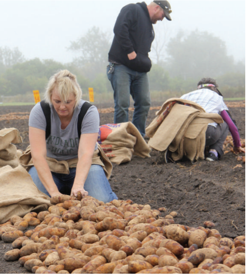
After the kids Potato Scramble, it is time for the adults to dig in the dirt during the Potato Picking Contest. Potato pickers do just that. Pick as many potatoes as possible in an allloted amount of time. A gleaner picks up potatoes left behind and this amount, plus penalty, is subtracted from the total weight.

If you would like more information please visit us at www. potatodays.com or call us on the "spud" line at 1-800-525-4901! See you at Potato Days!