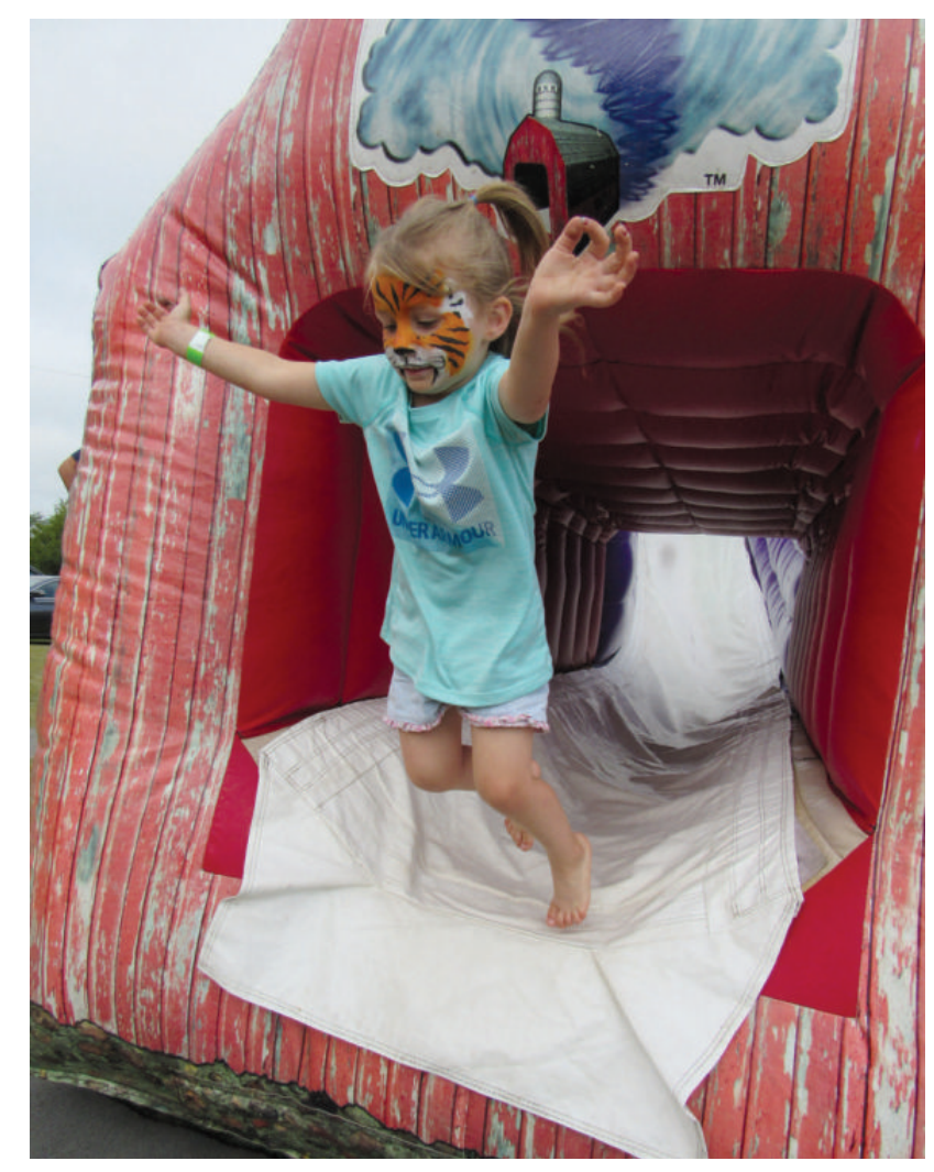
The Potato Days Festival features something for everyone. Just south of Midwest Bank, a variety of inflatibles are setup for kids to blow off some steam and get rid of some pent up energy.

make up the Potato Days Festival held annually Friday and Saturday, August 23 and 24 in Barnesville.