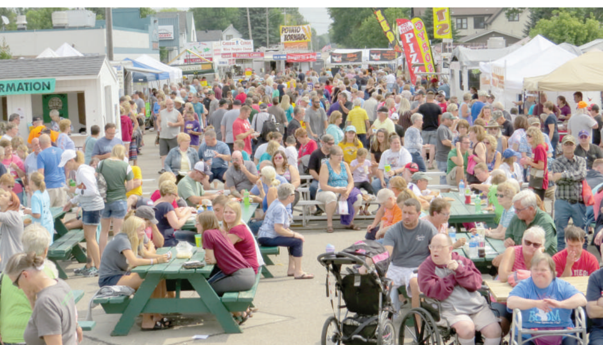
Festival. Back for it's 28th annual year, the festival is set for Friday and Saturday, August 23 and 24,2019.

200 North Mill Street Fergus Falls, MN 218 736-6073