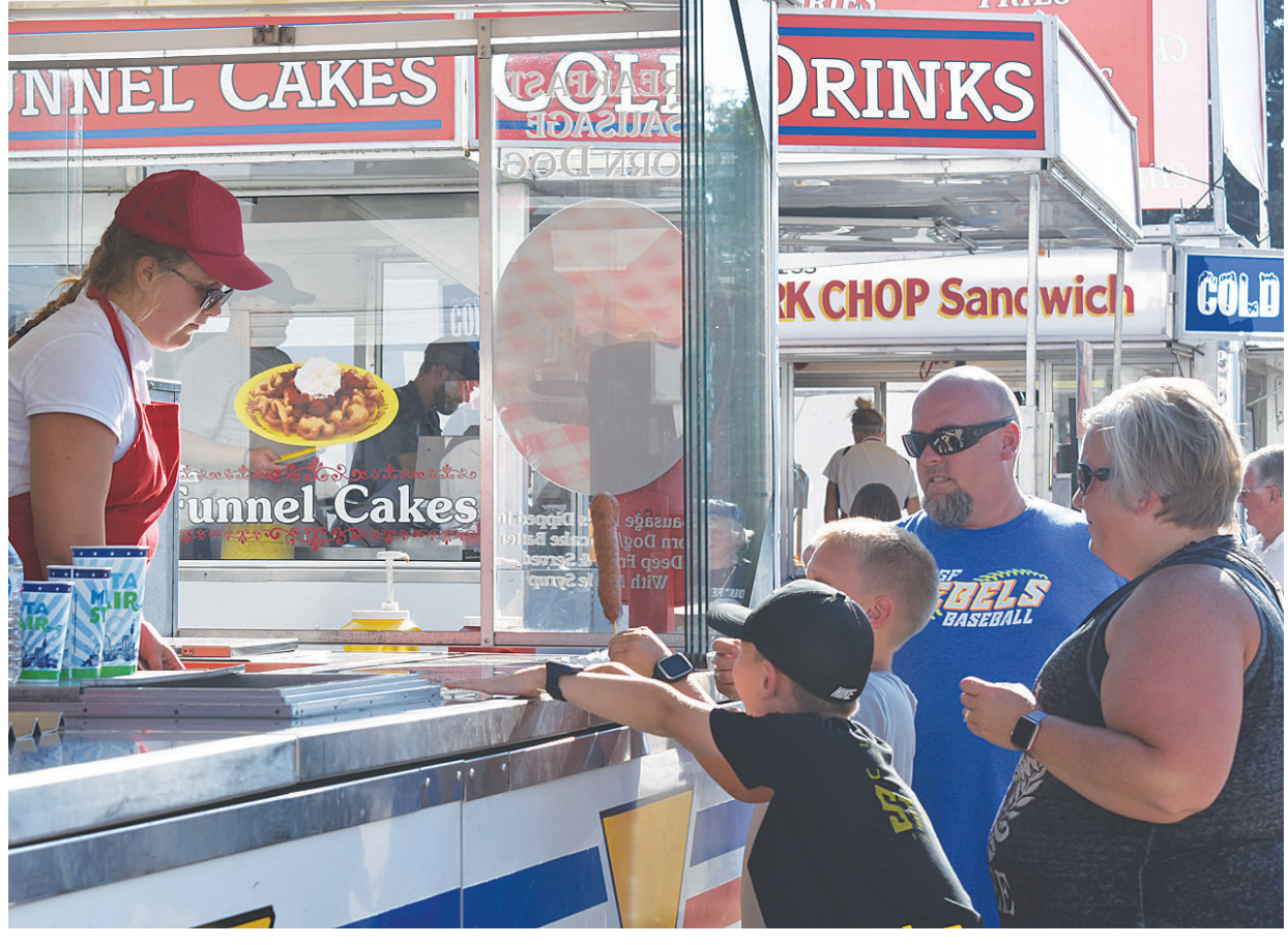
Food at the Clay County Fair is just the best treat in the summer. Families can get a meal or snack at numerous food stands throughout the grounds.

The Clay County Fair has been going strong for 106 years. It might seem that going to the fair each July would get old. But there is always something new and exciting going on at the county fair.