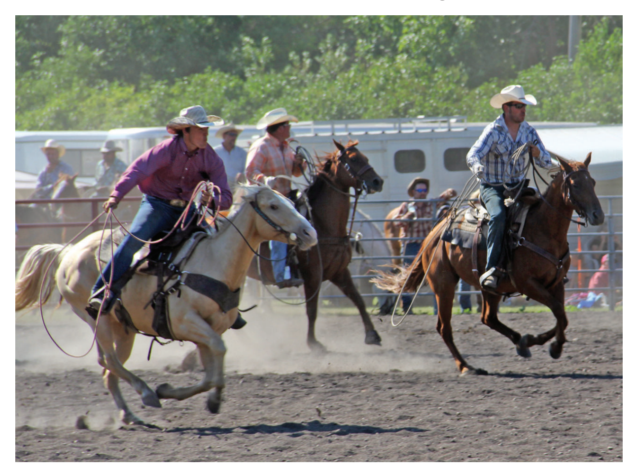
The Diamond Ranch Rodeo is a great event to enjoy at the Clay County Fair. Competitors vie for prizes, and the event is free to the public. There are also events for youth to enter. Plans are underway to organize this event for 2019. Watch the Record-Review for updates on the rodeo.