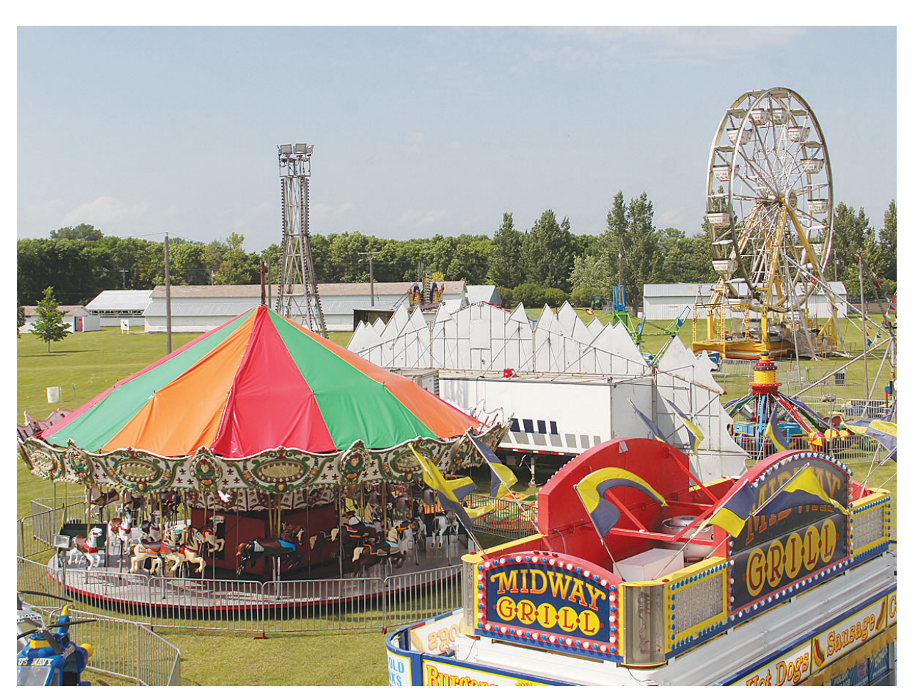
Come and experience all of the fun that the Midway has to offer at the 2019 Clay County Fair held July

The 4-H Building is always interesting to tour. It is home to exhibits varying in subject matter