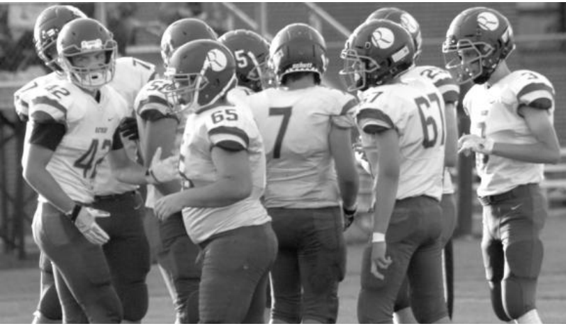
The Tigers breaking out of their huddle.