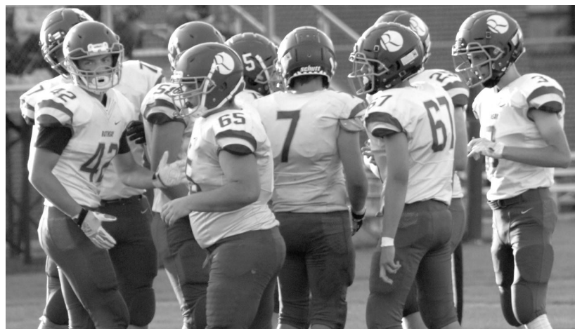
The Tigers breaking out of their huddle.