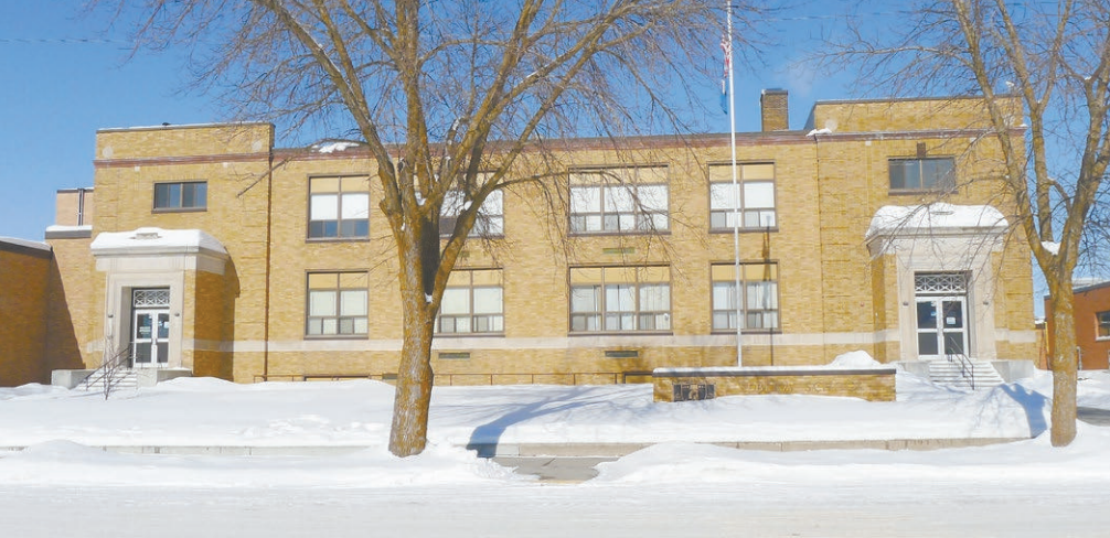
The oldest building on the Sebeka School campus, above, will be demolished in the spring. To the right and below are artist renderings of what the new addition should look like from the outside and inside.