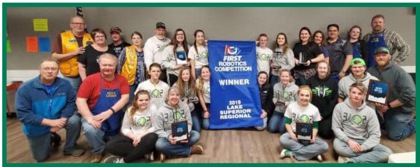
Super fun night at the Red River Event Center on Friday, April 12! We are so thankful for our awesome community, you guys rock! #winnerwinnerfishdinner.