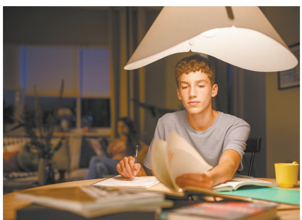
Improving the comfort of your eyes could be as simple as changing a light bulb.

For many consumers, the disconnect may stem from overwhelming choice when it comes to home lighting and from not having enough infor-