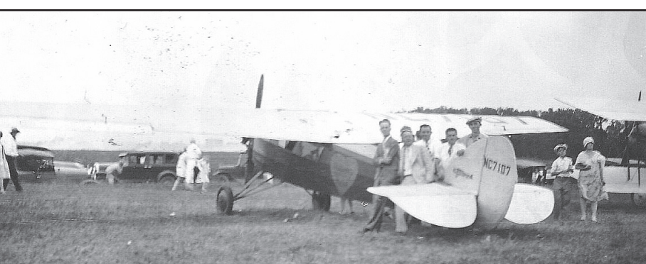
Plane for Fairbanks, Alaska, at the dedication of Hoisington Airport, July 28, 1929.