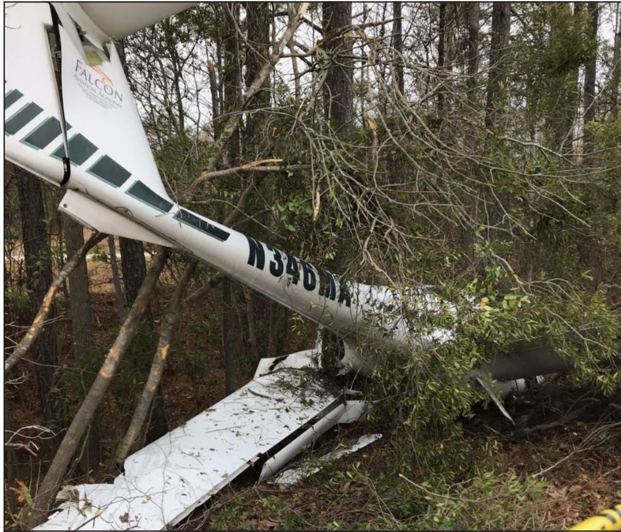
No one was injured when this plane went down near Georgia Pacific on Dec. 19. The pilot and passenger stated they experienced engine problems.

Vol. 117, No. 1 120 South Main Street McCormick, South Carolina www.themccormickmessenger.com (864) 852-3311 75 cents