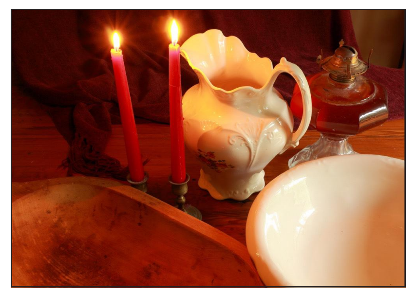
Washbasin candles.

The McCormick County Department of Health & Human Services & Department of Social Services would like to thank the following for their generous Christmas donations to the citizens of McCormick County: Good Shepherd Catholic Church, Buffalo Baptist Church, Mt. Zion AME Church of McCormick, McCormick EMS, McCormick Dive