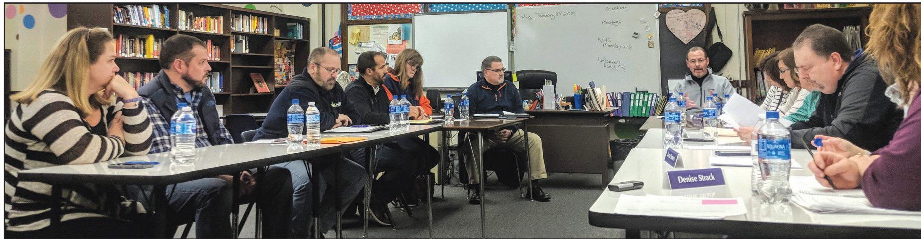
Cerro Gordo and Bement School Boards meet again to discuss future sports cooperation with their Junior High Sports.