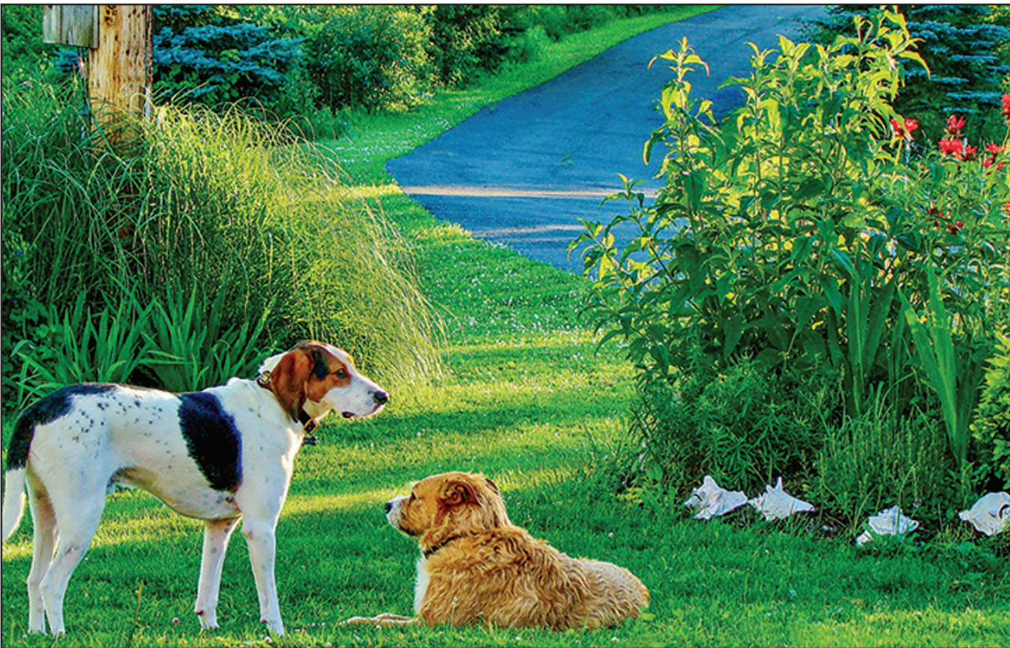
Dog owners with yards know that dogs benefit greatly from some exercise in the backyard. While that time might be great for dogs, it can take its toll on lawns.

the excess nitrogen content. Nitrogen also is present in lawn fertilizers, further exacerbating the problem for pet owners who fertilize their lawns. In addition to urine damage, dogs can trample frosted grass, contributing to problems that may not become evident until spring, and get into areas like gardens where they wreak additional havoc. Pet owners who want to let their dogs run free in the yard but don't want damaged grass may be tempted to put their pooches in diapers or confine them to crates when letting them outside. But such an approach isn't necessary. In fact, some simple strategies can be highly effective at