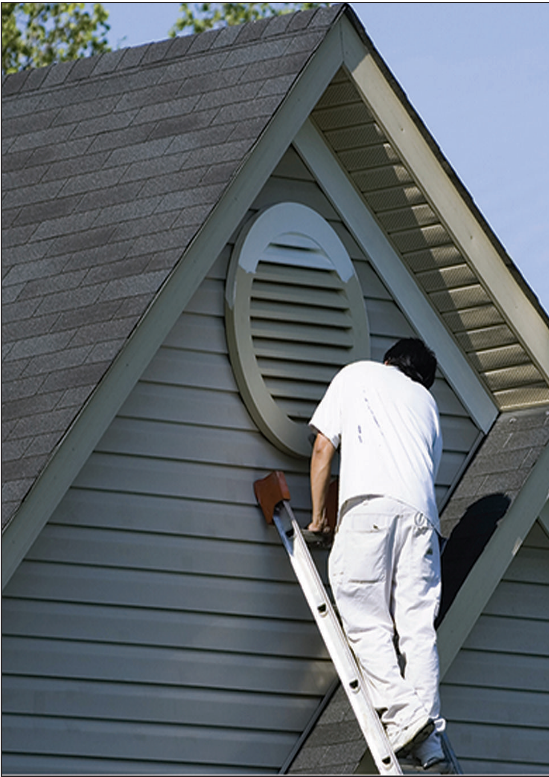
Exterior paint can fade, chip and peel due to various environmental factors. As a result, many homes can likely use a fresh coat of paint in at least one room.