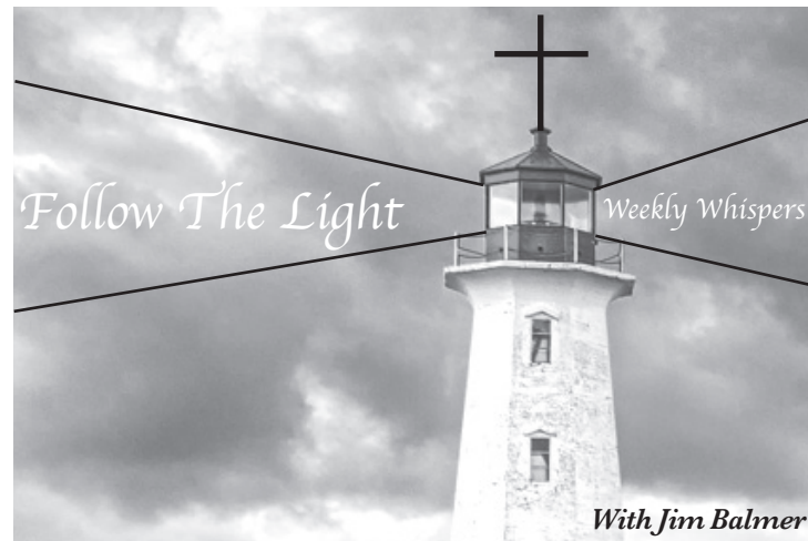
With Jim Balmer

The Lord is king. He is clothed with majesty and strength. The earth is set firmly in place and cannot be moved. Your throne, O Lord, has been firm from the beginning, and you existed before time began. The ocean depths raise their voice, O Lord; they raise their voice and roar. The Lord rules supreme in heaven, greater than the roar of the ocean, more powerful than the waves of the sea. Your laws are eternal, Lord, and your Temple is holy indeed, forever and ever.