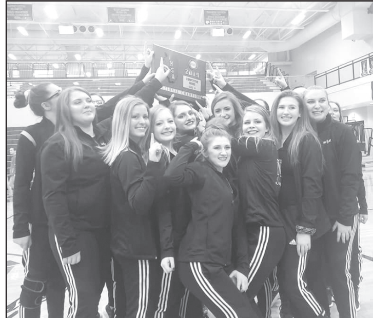
The Villa Grove Devilettes were crowned the winners of the IHSA 1A competitive dance sectional competition at Mascoutah on January 19. With the win, the Devilettes qualified for the IHSA state finals, to be held at Bloomington's Grossinger Motors Arena on January 25-26.