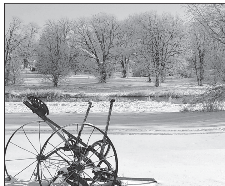
A blanket of snow and ice crystals covering the trees in Villa Grove, IL. To comment on any of the photos featured in Signs of the Season email us at vgnews@mchsi.com or send a letter to Villa Grove News PO Box 20, Villa Grove IL 61956. Comments may be published in future editions of the newspapers.