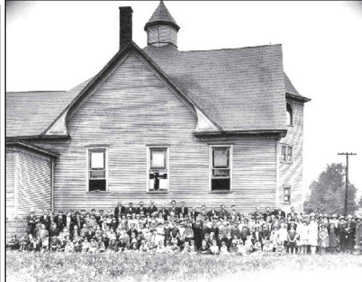
Photos Top: Villa Grove Christian Church in 1925, Left: Villa Grove Methodist Church was moved into town in 1889 and burned to the ground in 1900.