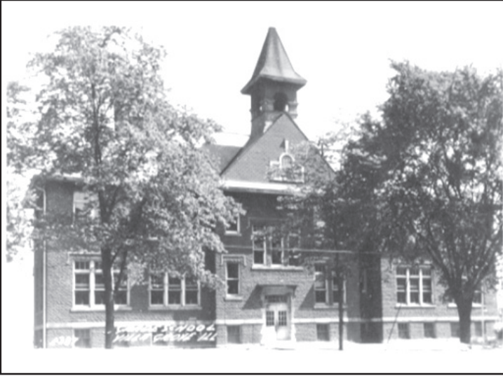
Photo on Left: Villa Grove Highschool 1953. Photo on Right: Villa Grove Grade School 1930.