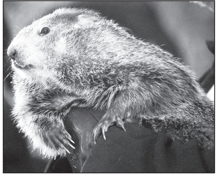
Punxsutawney Phil emerged from his burrow Saturday, February 2 at Gobbler's Knob in Punxsutawney, Pennsylvania, around 7:30 a.m. ET and did not see his shadow, predicting an early spring for us all.