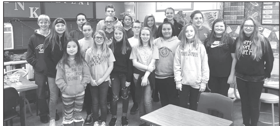
Villa Grove Students participate in this years Spelling Bee.