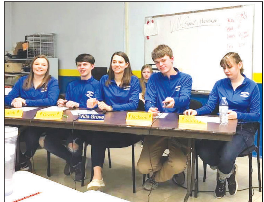
The Villa Grove Scholastic Team is now the Masonic Lodge Champs and LOVC SE Division Champs! They will crossover and play NW for overall championship.