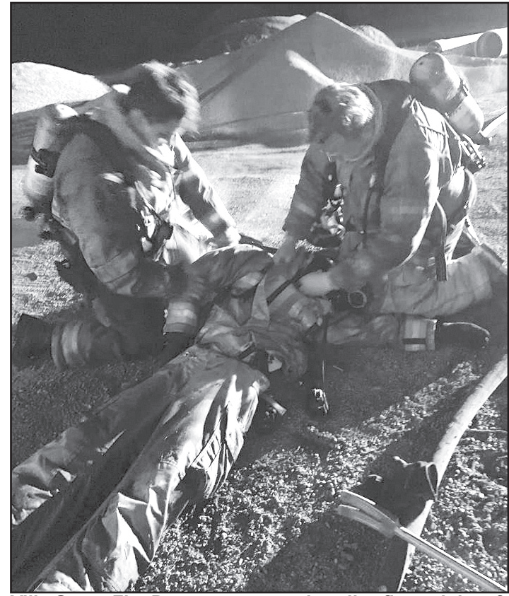
Villa Grove Fire Department practices live fire training, focusing on search, rescue and rapid intervention for trapped victims.