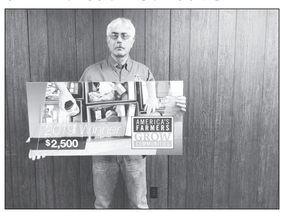
About the Monsanto Fund The Monsanto Fund, a philanthropic arm of Bayer, is a nonprofit organization dedicated to strengthening the communities where farmers and Bayer employees live and work. Visit the Monsanto Fund at www.monsantofund.org .

Communities partners with them to direct donations to the organizations they are passionate about and that make a positive impact and a better life in communities." To learn more about the America's Farmers Grow Communities program, visit HYPERLINK "http://www.AmericasFarmers.com" or follow on Facebook at facebook.com/AmericasFarmers . About America's Farmers Started in 2010, the America's Farmers programs, sponsored by the Monsanto Fund, a philanthropic arm of Bayer, have been dedicated to partnering with farmers to strengthen rural communities. The programs provide funding for ag scholarships, nonprofit donations and school STEM grants. Since inception the fund has awarded over $50 million to rural communities. For more information visit AmericasFarmers.com .