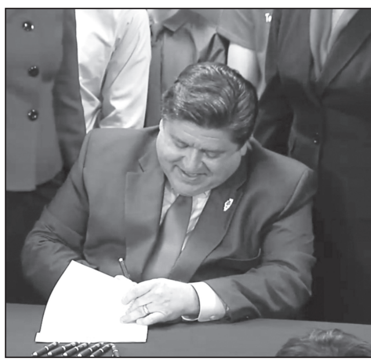
Gov. J.B. Pritzker on Sunday signs into law a bill that raises to 21 the minimum age people can legally buy tobacco products in Illinois. Pritzker signed the legislation at the Mile Square Health Center in Chicago.

publican Gov. Bruce Rauner vetoed Tobacco in the previous session. In his message to lawmakers, he agreed smoking is "detrimental" to Illinoisans' health, but said that raising the age to purchase cigarettes would cause unintended economic consequences. Because Illinois would become the first Midwestern state with such a law, Rauner wrote, it would "push residents to buy tobacco products from non-licensed vendors or in neighboring states." At the signing ceremony Sunday, Pritzker seemed to respond to the former governor's criticism. "This is about the health of our youth and the longevity of our citizens," he said, "and if there are young people who will travel over state lines to buy tobacco products because they can legally buy them there, then I urge the surrounding states to pass 'Tobacco 21,' too."